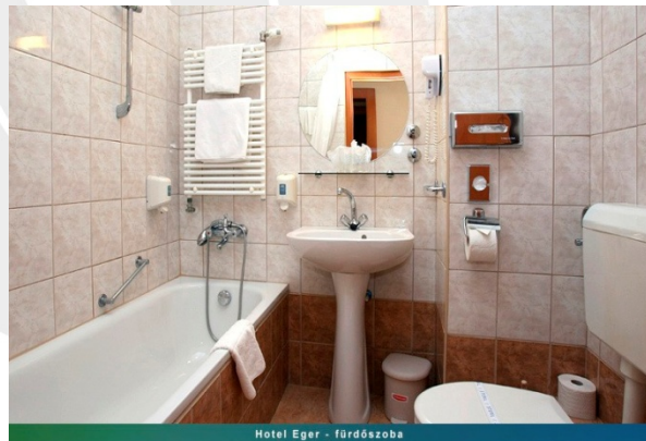
Bathroom (also accessible)