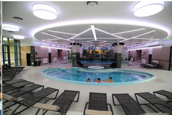
Accessible wellness area